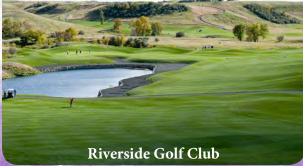
Riverside Golf Club

To the 29th Annual Women in Golf North/South Shootout... Putting on the Ritz... Texas Style!